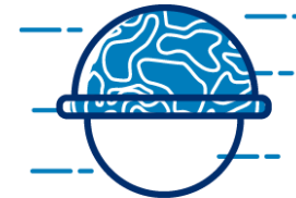
Active Duty Military