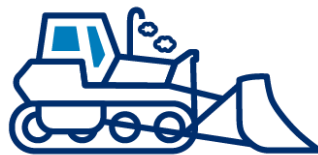
Machinery & Equipment