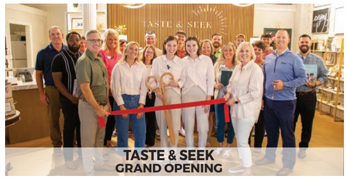
TASTE & SEEK GRAND OPENING

Our mission is to provide a joyful atmosphere where others feel at home, and taste and see the goodness of the Lord!