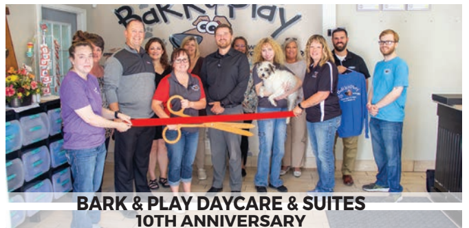
BARK & PLAY DAYCARE & SUITES 10TH ANNIVERSARY