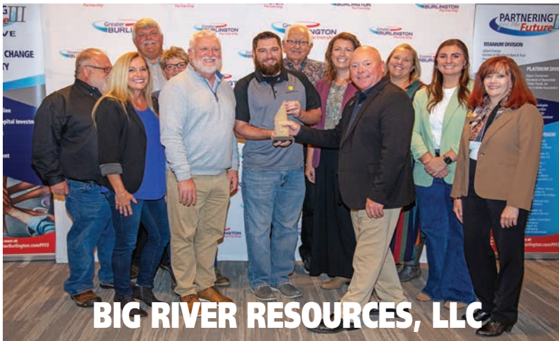
BIG RIVER RESOURCES, LLC