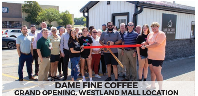
DAME FINE COFFEE GRAND OPENING, WESTLAND MALL LOCATION