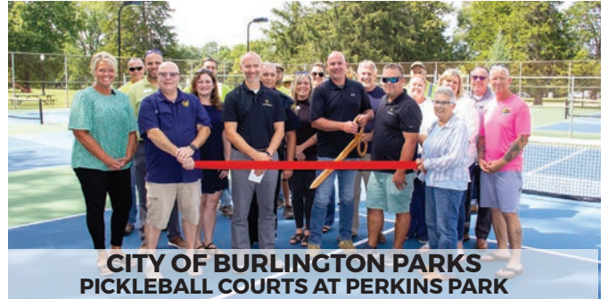
CITY OF BURLINGTON PARKS PICKLEBALL COURTS AT PERKINS PARK