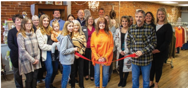
NANA & ME Celebrating the opening of their new location.