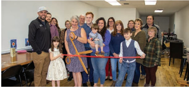
FIRST CROSSING Celebrating their grand opening.