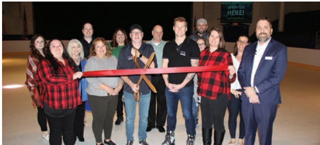
BURLINGTON RIVERFRONT ENTERTAINMENT, MEMORIAL AUDITORIUM Celebrating the new synthetic ice-skating rink.