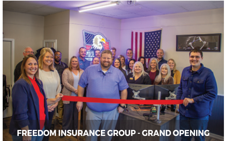
FREEDOM INSURANCE GROUP - GRAND OPENING