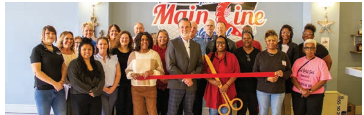
THE MAIN LINE RESTAURANT GRAND OPENING