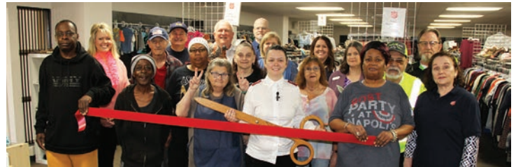
THE SALVATION ARMY THRIFT STORE REMODEL