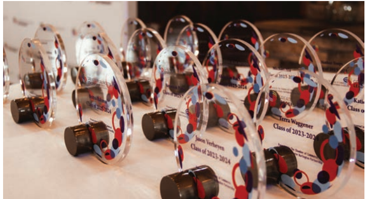
On May 15 at Barn on the Ridge Event Center, the Burlington/West Burlington Area Chamber of Commerce celebrated the Graduation of the 2023 - 2024 Leadership Class.

The Burlington / West Burlington Area Chamber of Commerce is accepting applications for the 2024 - 2025 Greater Burlington Leadership Class. This nine-month program features professional development classes aimed at enhancing leadership skills. Participants, whether experienced or developing leaders, gain a comprehensive understanding of civic responsibilities through onsite tours, behind-the-scenes experiences at various institutions, and interactions with influential individuals shaping the Greater Burlington community. Additionally, Greater Burlington Leadership participants explore relevant leadership topics, including communication styles, personal and interpersonal skills, project management, and more.