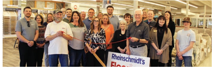
RHEINSCHMIDT'S FLOORING AMERICA REMODEL