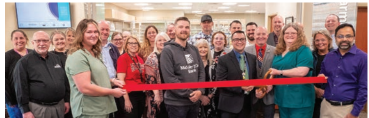
COMMUNITY HEALTH CENTERS OF SOUTHEASTERN IOWA, INC. OPENING OF NEW PHARMACY