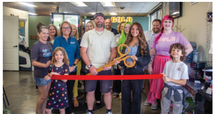
BOLD BEAUTY BAR - NEW SERVICES