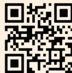
Intern Connection Luncheon Registration

The Intern Connection Program is offered free to Chamber members, continues to support workforce development through initiatives like this luncheon, the monthly Intern Insider e-newsletter, and additional intern-focused events. Together, these efforts aim to encourage interns to consider Greater Burlington as a long-term place to live, work, and grow their careers.