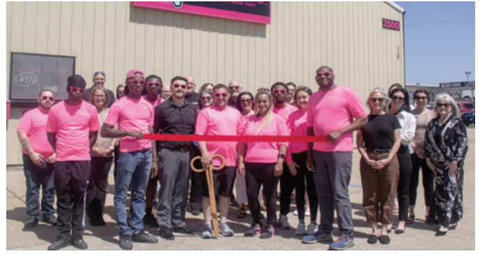
DIXON'S SEAMLESS GUTTERS, LLC - NEW LOCATION