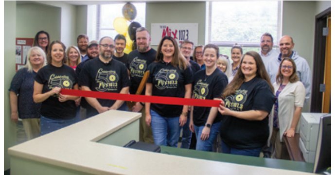
THE NEW MIX 107.3 KGRS - 50TH ANNIVERSARY