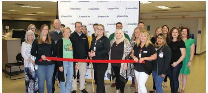
IMPACTLIFE 50TH ANNIVERSARY