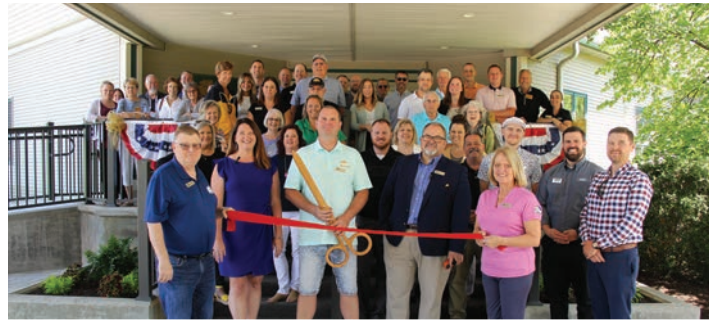
BURLINGTON GOLF CLUB 125TH ANNIVERSARY