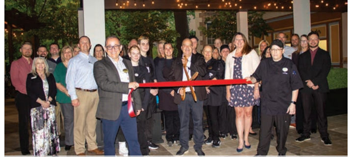
LUCKY STREET & SHAKE ALLEY GRAND OPENING