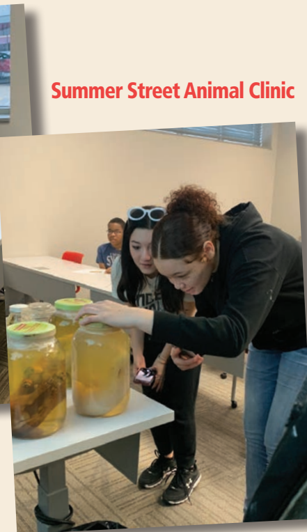
Summer Street Animal Clinic