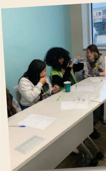
Klingner and Associates, P.C.

873 Students participated with 48 Businesses learning about local careers