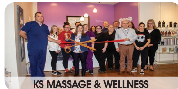
KS MASSAGE & WELLNESS