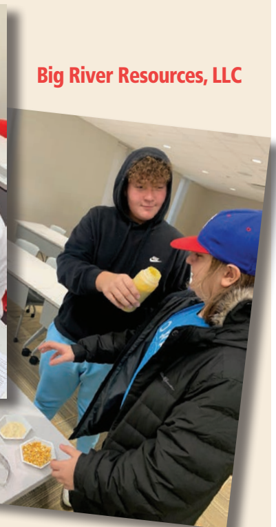
Big River Resources, LLC