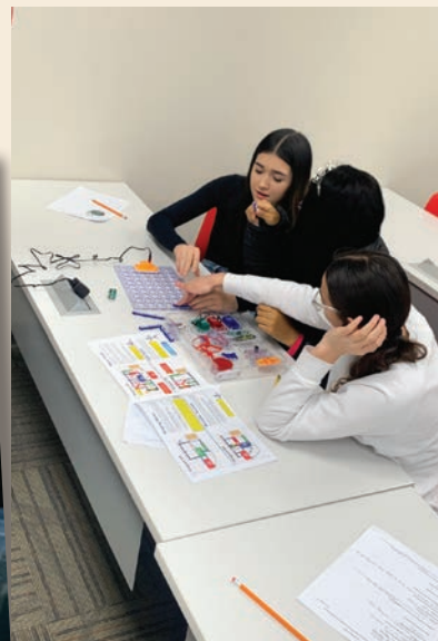
IBEW Local 13