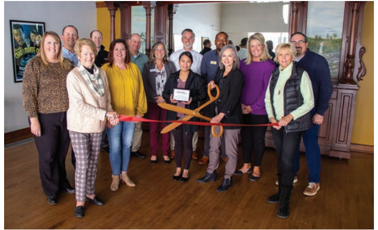
CAPITOL PERFORMING ARTS CENTER 85TH ANNIVERSARY Capitol Performing Arts Center celebrates their 85th Anniversary