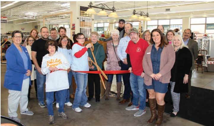
HOPEFULLY YOURS 20TH ANNIVERSARY Hopefully Yours celebrates their 20th Anniversary