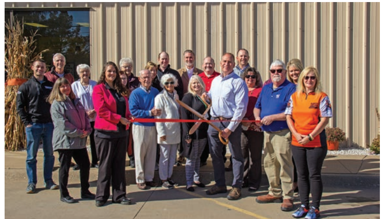
GREAT WESTERN SUPPLY 1ST ANNIVERSARY Great Western Supply 1st Anniversary