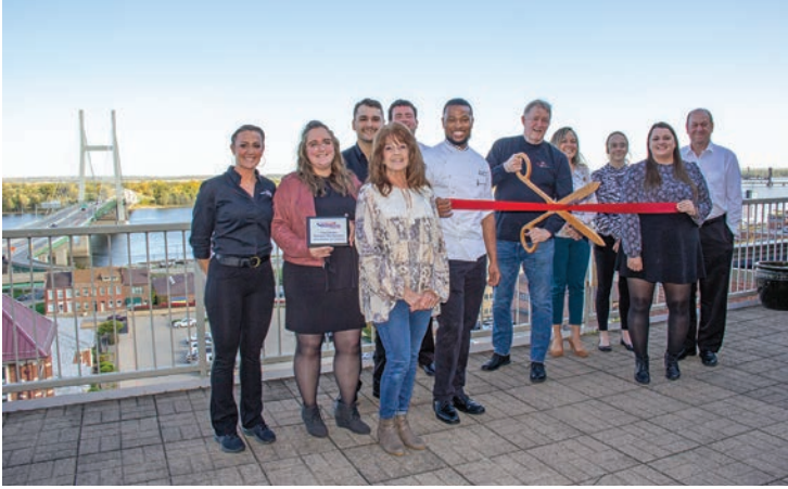
MARTINI'S 25TH ANNIVERSARY Martini's Grille celebrates their 25th Anniversary