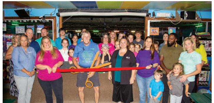
KENNY'S ROLLER RANCH 25TH ANNIVERSARY