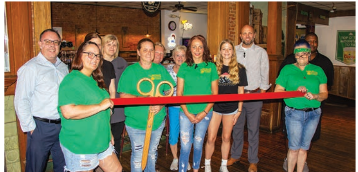
CAULEY'S SHAMROCK IRISH PUB & GRILL GRAND OPENING