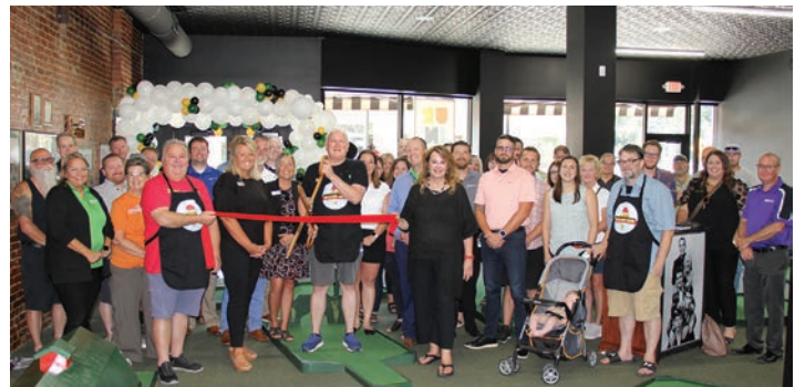
BURLINGTON BLACK WATER, LLC GRAND OPENING