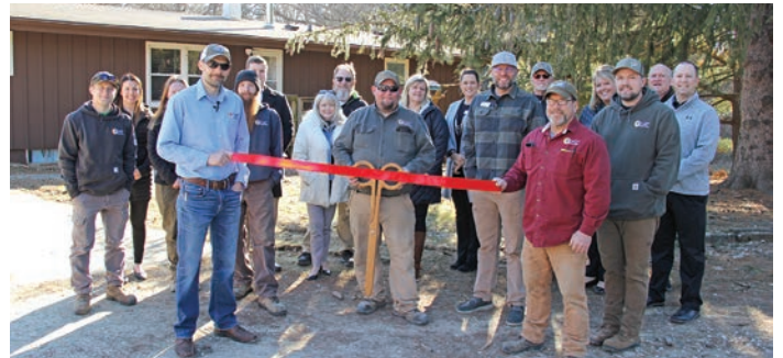
DES MOINES COUNTY CONSERVATION RANGER CABIN REMODEL