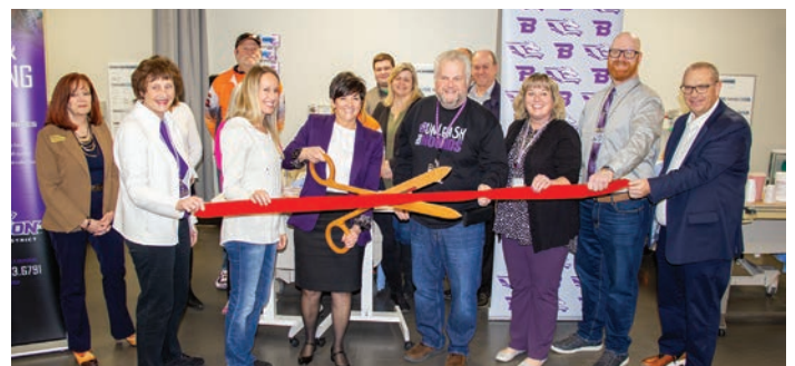
BURLINGTON COMMUNITY SCHOOL DISTRICT BURLINGTON HIGH SCHOOL REMODEL