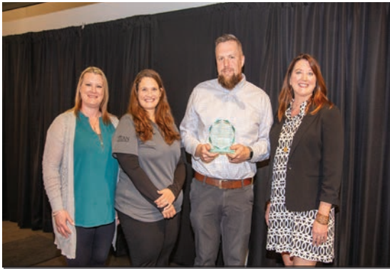
Titan Broadcasting & Digital Group winner of the 2023 Small Business of the Year Award

May is Small Business Month, and the Greater Burlington Partnership is celebrating by recognizing the incredible businesses of Greater Burlington at the 2024 Small Business Breakfast.