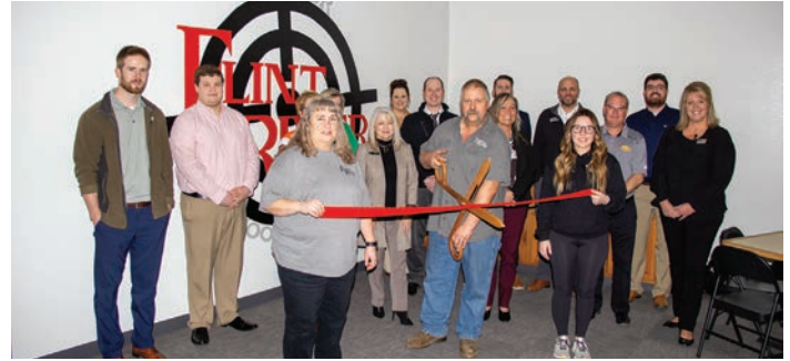
FLINT RIVER INDOOR SHOOTING RANGE 5TH ANNIVERSARY